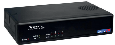
DSP4 Monitoring System

The DSP4 can record all events in its database with a time stamp of when the sensor alarm was raised and the action taken place. A standalone product with no external software dependencies, the DSP4 gives you the very best for your monitoring needs. It has 4 auto-sense intelligent sensor ports which work with a wide range of intelligent sensors. It can use any combination of sensors to monitor temperature, humidity, water leakage, airflow, security and even control relays.